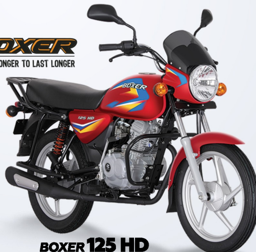
BOXER 125 HD