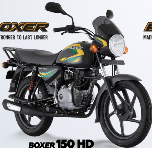
BOXER 150 HD